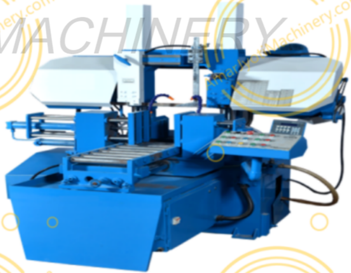
METAL CUTTING BANDSAW AUTOMATIC