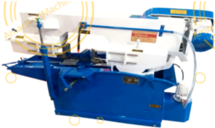
METAL CUTTING BANDSAW