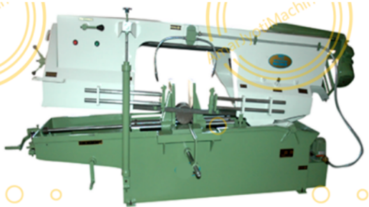
METAL CUTTING BANDSAW